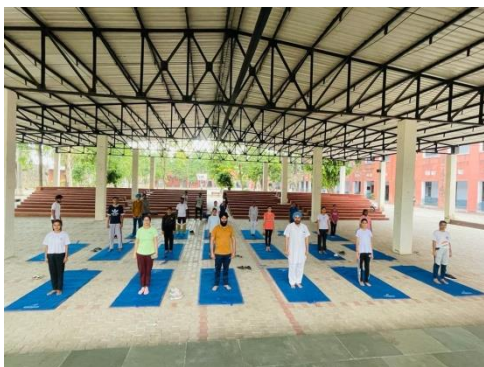
Teachers Participating in Yoga Camp