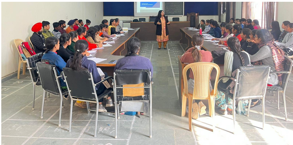
Students attending the Training