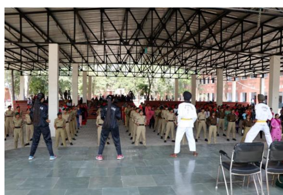
Students getting Training of Martial Arts