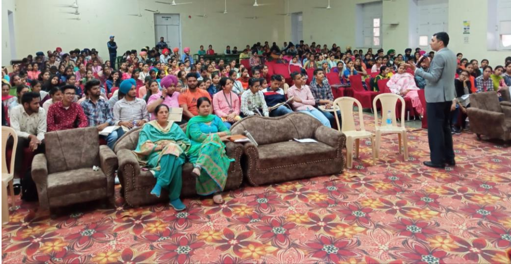
Students Attending the Session