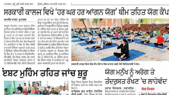
News Coverage of Yoga Camp