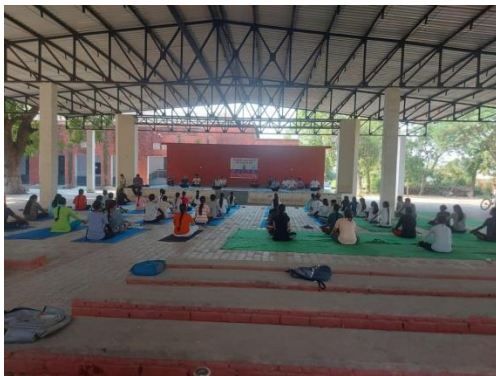
Students doing Yoga in the Session

Through interactive sessions, participants learned to cultivate a balanced mind and body. The camp not only focused on the physical benefits of yoga but also delved into its philosophical aspects, encouraging students to explore the deeper dimensions of the practice. The Yoga Camp concluded with a sense of accomplishment, as participants not only gained practical skills but also imbibed the essence of yoga's philosophy. This event focuses on nurturing well-rounded individuals and equipping them with tools for lifelong well-being.