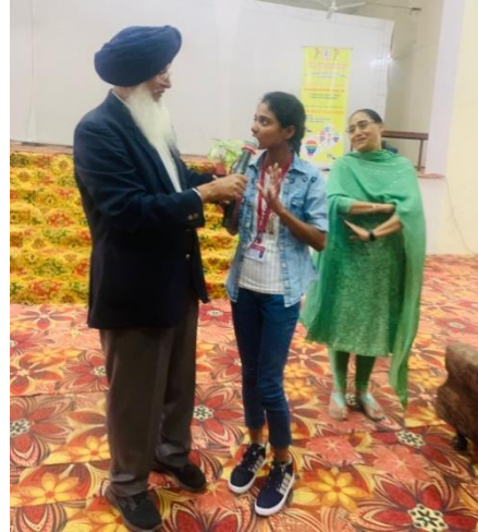
Interaction with Students