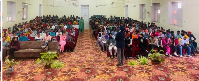
Students Attending the Lecture